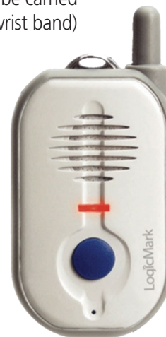
Transmitter showing speaker phone

If the center can not contact the caller or determine whether an actual emergency exists, they will notify emergency providers to go to the caller's home, monitoring the situation until the problem is resolved.